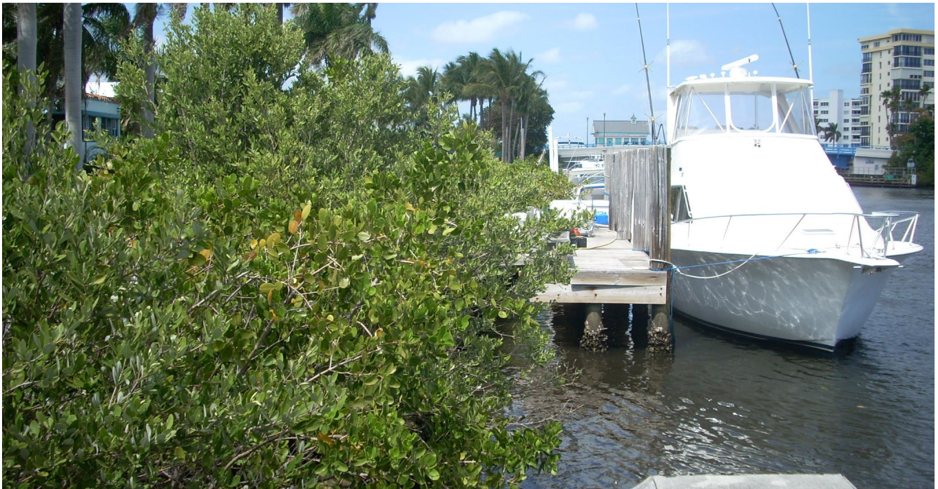
South Florida Mangrove Barrier

When combined with gray strategies, green mitigation strategies can play an important role in protecting buildings and vital infrastructure.