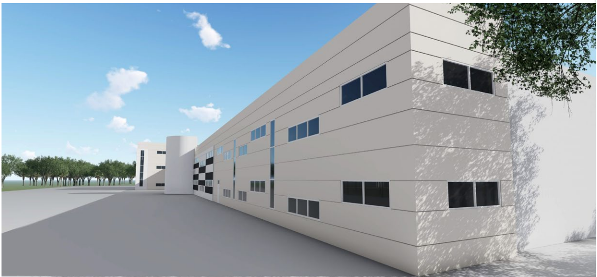
3D Rendering of the Palm Beach Sheriff's Office Renovated Headquarters, Palm Beach County, FL

Florida's Palm Beach County provides an excellent example of how a community can take a comprehensive approach to protecting vital assets and infrastructure. The County has implemented an aggressive hardening program that is protecting the Palm Beach County Sheriff's headquarters, public schools, civic centers, and structures and buildings for various water utilities.