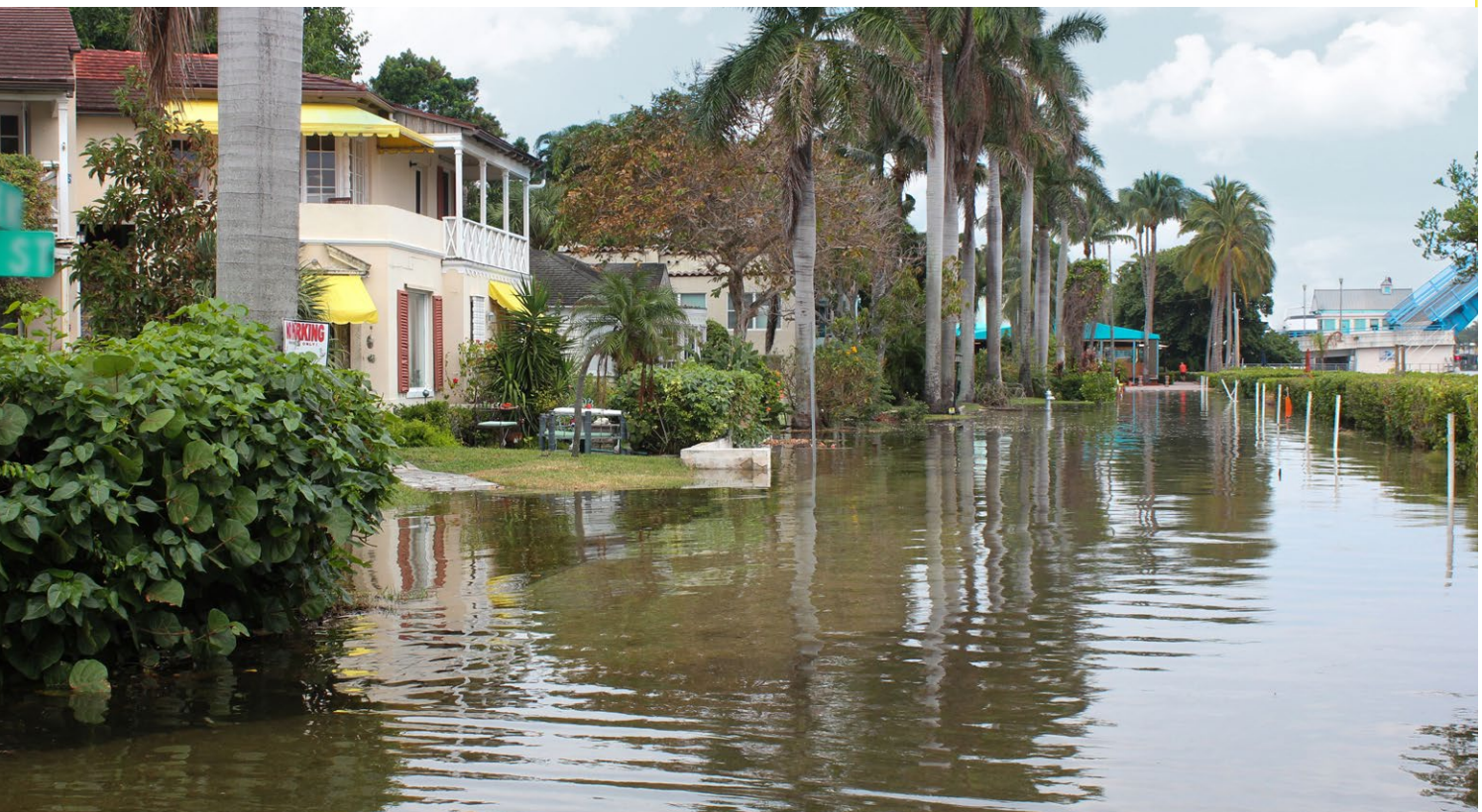
'Sunny Day' High Tide Floods Are On The Rise Along U.S. Coasts

When people think of storm damage, they tend to focus on structures or land erosion, but public infrastructure, particularly emergency infrastructure, is an equally vital concern. How do you care for the public during an emergency if you lose the safe haven for first responders—water and sewer, or fire-prevention capabilities? The answer, of course, is that you can't. Cities and towns that don't take pre-emptive action to protect this vital infrastructure are often faced with disaster when hit by extreme storms. In the immediate aftermath of a storm event, it's too late. All that can be done is to plan for the next inevitable extreme weather event.