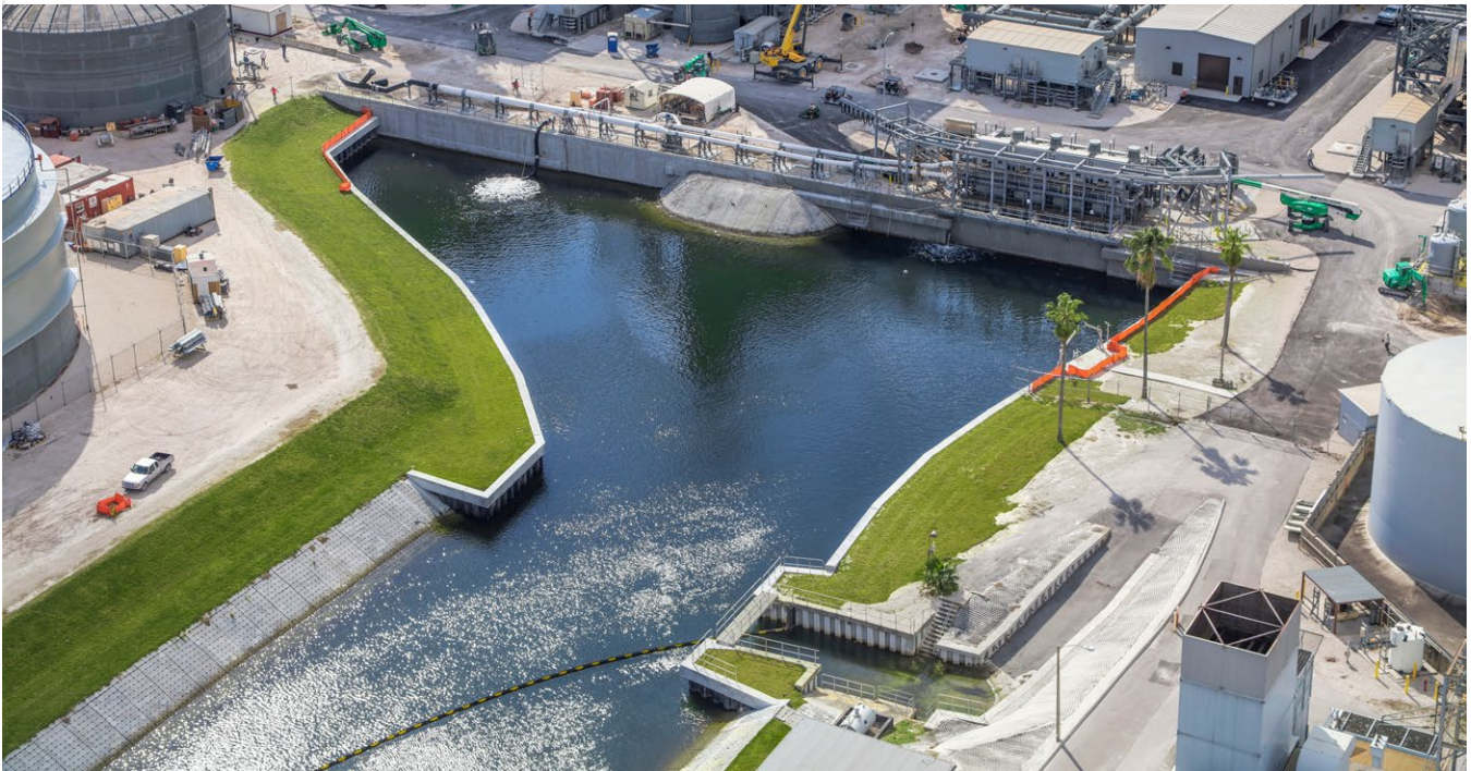
Florida Power & Light's Upgraded Port Everglades Power Plant, Fort Lauderdale, FL

Every seaside community or development — and those that are located along rivers and lakes, for that matter — should evaluate seawalls more than 20 years old to determine whether they can withstand current water elevations, as well as water elevations predicted for the future. If the seawall does not meet the current elevation criteria, a typical approach builds an entirely new seawall landward or waterward from of the existing seawall.