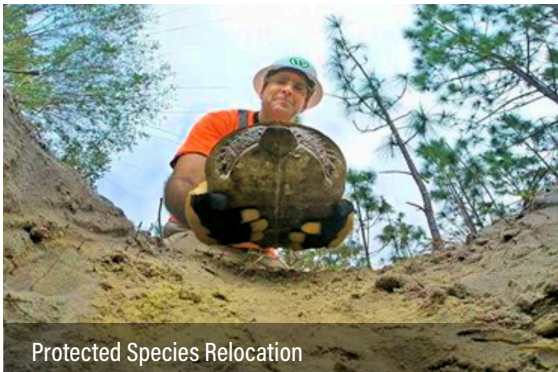
Protected Species Relocation