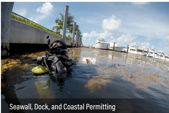
Seawall, Dock, and Coastal Permitting